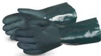
Acid Resistant Gauntlet Gloves