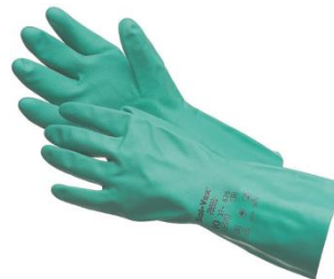
Green Sol-Vex Gloves